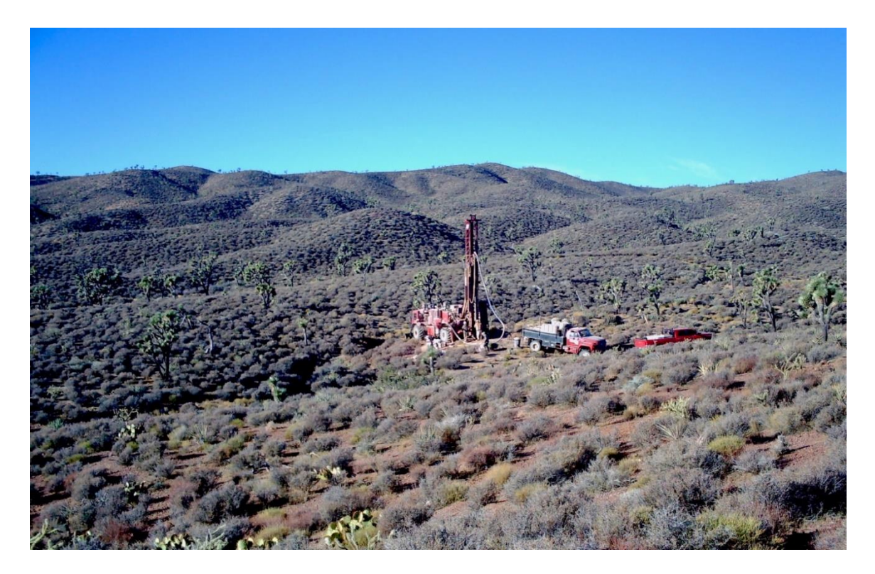
Figure 1: RC Drill Rig at Gold Basin Project (November 2020).

Historical exploration work on the Gold Basin Project indicated that oxide mineralisation extends from surface and a large number of historical drill holes were only 30m deep. In these areas and along the NW-striking mineralised zone (Figure 3), the drilling conducted under the Initial Drilling Program is intended to confirm mineralisation at depth, with drill holes expected to average ~75m with some holes extending to 100m. The RC drilling results from the Initial Drilling Program will also provide additional geological data in preparation for the next stage of drilling at the Gold Basin Project.